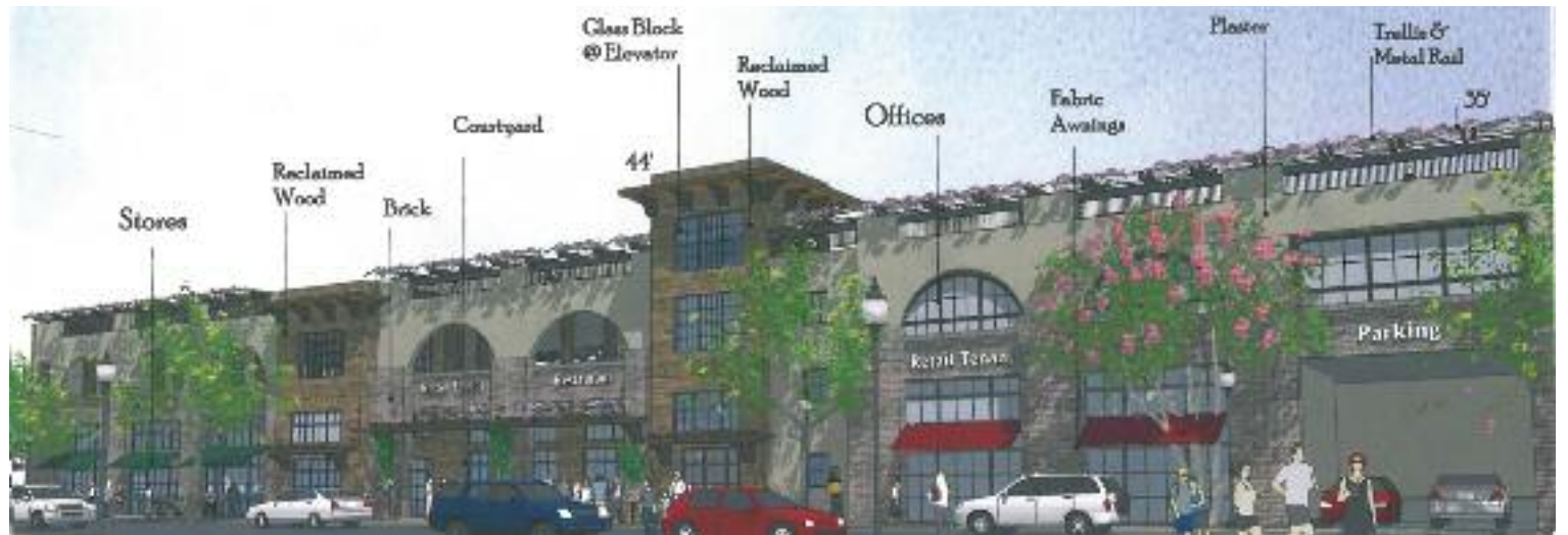
View from Orinda Way